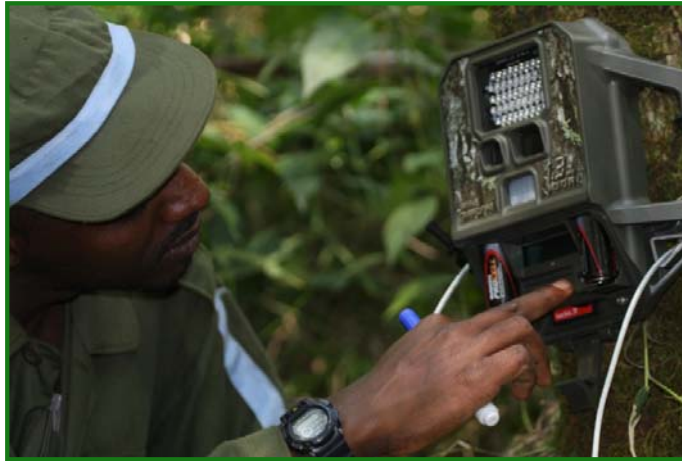
Park staff setting up camera trap